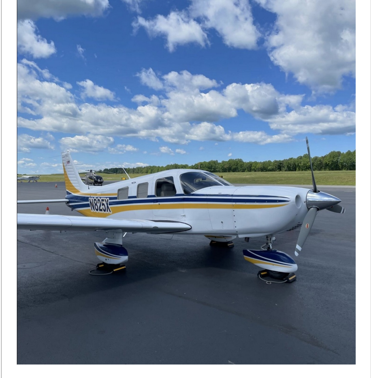
A few more basic facts about Ruff Rider.