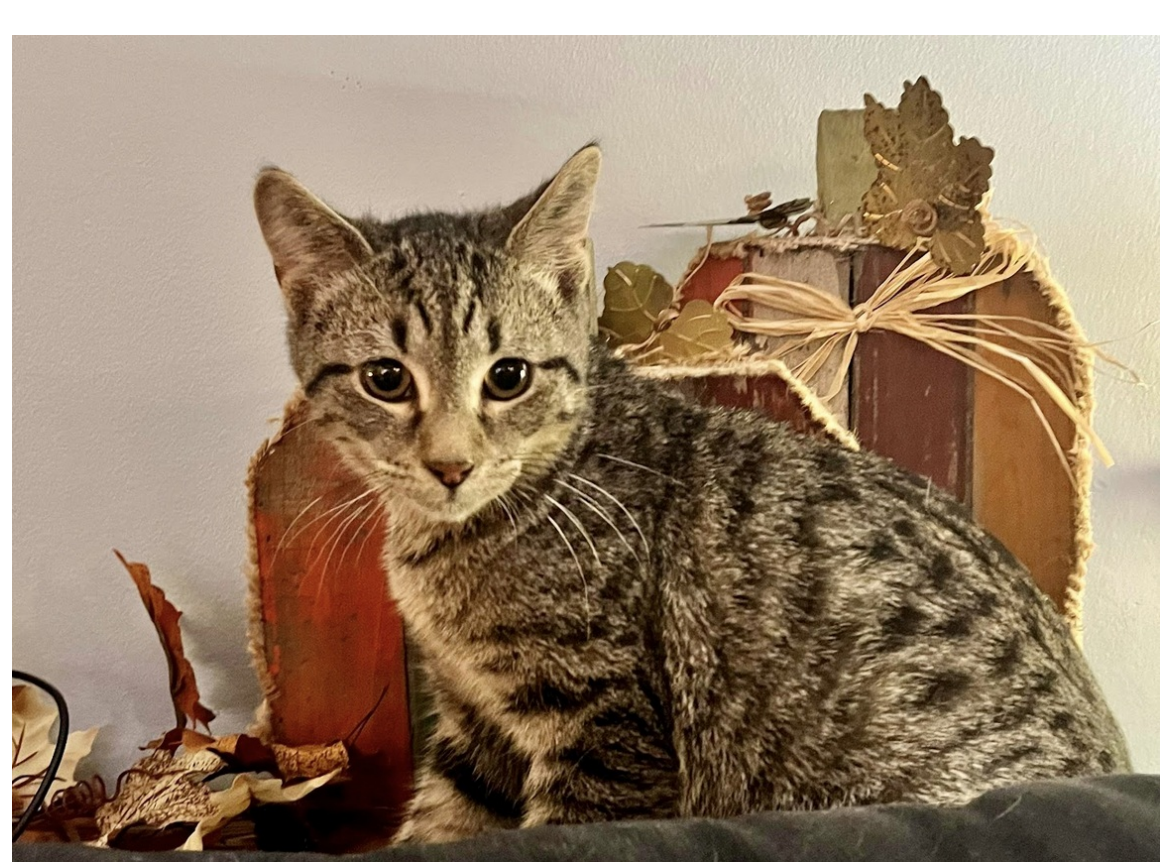
PTTR Guides 33 Cats to a Better Life in New England